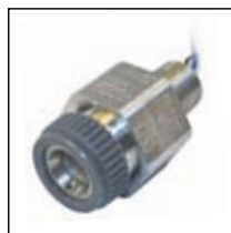
Sensor for Hydrogen Sulphide